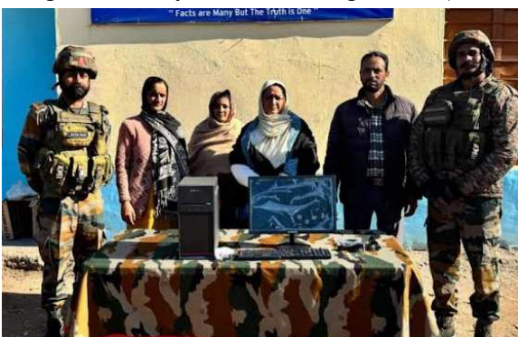
THE KASHMIR TALK BUREAU RAJOURI:

In a progressive step toward fostering digital literacy and academic growth, the Indian Army distributed computers to students of three schools in Gambir Mughlan, Rajouri district. The event was held at Higher Senior Secondary School, Gambir Mughlan (02 computers), Government Middle School Kakora (02 computers), and Government High School Dhargloon (01 computer). This initiative aimed to integrate technology into education, enabling students to access digital resources and enhance their academic capabilities. The event emphasized the role of technology in shaping the future, urging students to utilize these tools for self-development and achieving excellence in education.