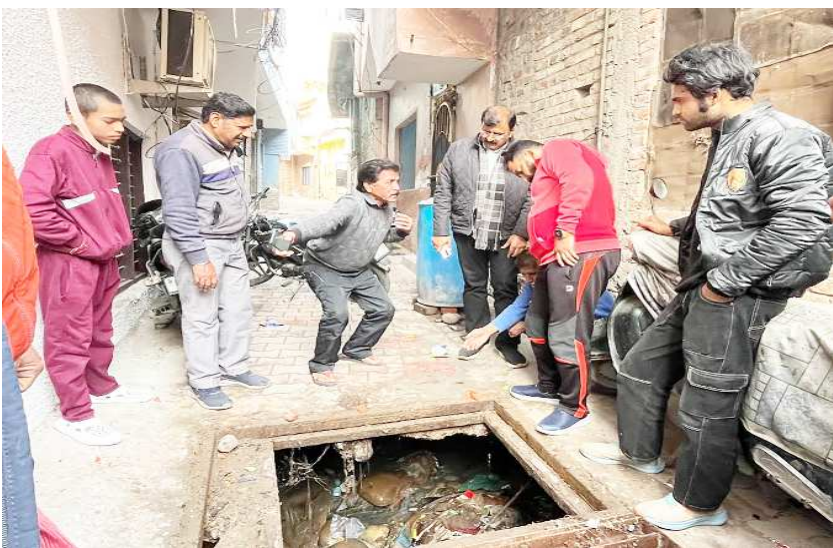
THE KASHMIR TALK BUREAU JAMMU: