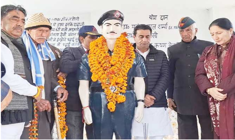
THE KASHMIR TALK BUREAU JASROTA:

Participates in Shoba Yatra to mark first anniversary celebrations of Ram Lalla idol consecration ceremony