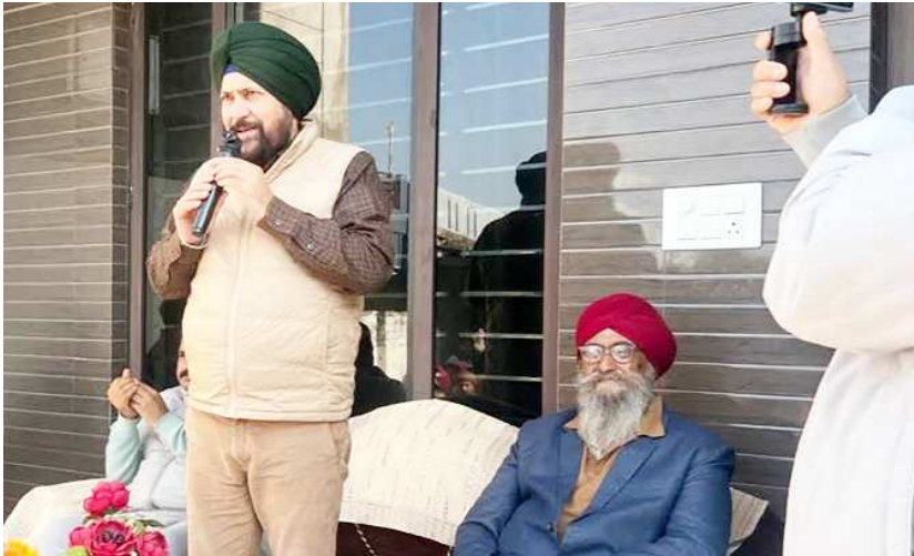
THE KASHMIR TALK BUREAU JAMMU:

The Modi Government, inspired by Dr. B.R. Ambedkar's vision of social justice and equality, has implemented a range of transformative policies and initiatives that align with his ideals. As the architect of the Indian Constitution, Dr. Ambedkar championed the rights of marginalized communities, emphasizing economic empowerment, social dignity, and equal opportunities for all.