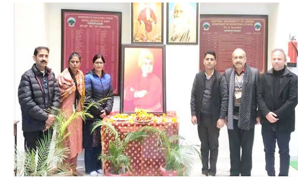
THE KASHMIR TALK BUREAU JAMMU: