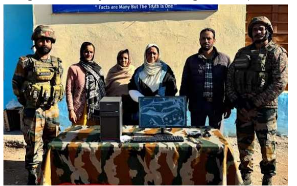
THE KASHMIR TALK BUREAU RAJOURI:

In a progressive step toward fostering digital literacy and academic growth, the Indian Army distributed computers to students of three schools in Gambir Mughlan, Rajouri district. The event was held at Higher Senior Secondary School, Gambir Mughlan (02 computers), Government Middle School Kakora (02 computers), and Government High School Dhargloon (01 computer). This initiative aimed to integrate technology into education, enabling students to access digital resources and enhance their academic capabilities. The event emphasized the role of technology in shaping the future, urging students to utilize these tools for self-development and achieving excellence in education.