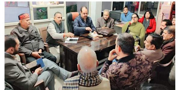
THE KASHMIR TALK BUREAU AKHNOOR: