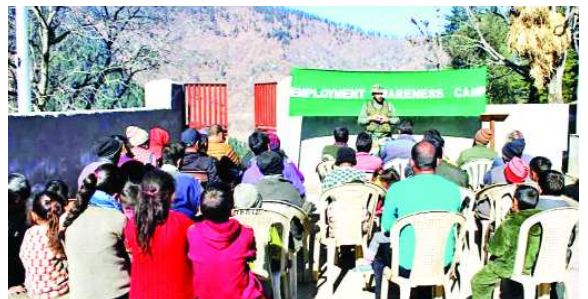
THE KASHMIR TALK BUREAU KISHTWAR:

The Indian Army conducted an Employment Awareness Camp at the remote village of Chas in the Kishtwar district of Jammu & Kashmir, reaffirming its commitment to empowering the youth of the region. This initiative aimed to provide career guidance and create awareness about various employment opportunities, particularly for young individuals aspiring to join the armed forces or seeking careers in other fields. A total of 47 youths from Chas and surrounding areas participated in the camp. Representatives from the Indian Army conducted interactive sessions to guide attendees on the recruitment process, eligibility criteria, and the various career paths available in the armed forces. These sessions provided valuable insights to the participants, helping them understand how to prepare for a career in defense services. In addition to information about joining the armed forces, the camp also highlighted other career avenues. Guidance was offered on government-sponsored vocational training programs, self-employment schemes, and opportunities in the private sector. By sharing information about these options, the Indian Army aimed to equip the youth with the knowledge to make informed career decisions.