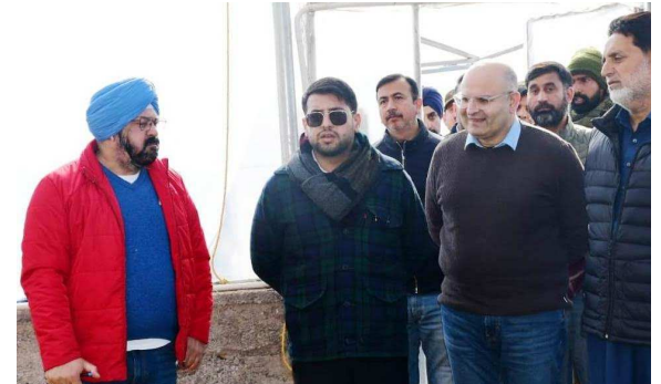
THE KASHMIR TALK BUREAU RAJOURI:

DC pushes for achieving maximum coverage under flagship schemes