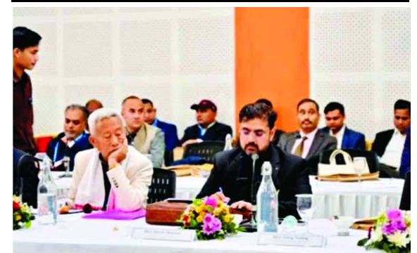
THE KASHMIR TALK BUREAU ASSAM:

J&K gets special projects for waterways, urban water transportation for tourism