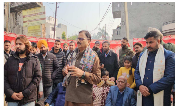
THE KASHMIR TALK BUREAU JAMMU:

Assesses development needs of locals of Bathindi Inspects restoration process of tube well at Karyani Talab