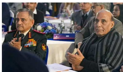
Manoj Sinha, Chief Minister Omar

Defence Minister Rajnath Singh and Chief of Defence Staff (CDS) General Anil Chauhan will attend the ninth Armed Forces Veterans' Day event here on Tuesday, a Defence Spokesman said. Jammu and Kashmir Lieutenant Governor